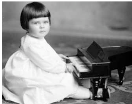
One of Stafford County Historical Museum's collection of 29,000 glass photographic negatives documenting life in Stafford County KS from 1880 to 1920

“Bald Eagles successfully nested at Quivira for the first recorded time in 2010, producing two eaglets. A pair of adults was seen attending the nest in early January 2011. Winter numbers of bald eagles in the Refuge area topped 200 in mid-December.”