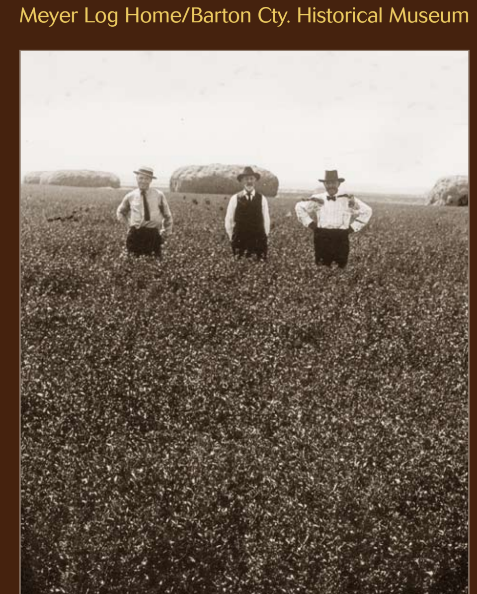
Prairie in Bloom