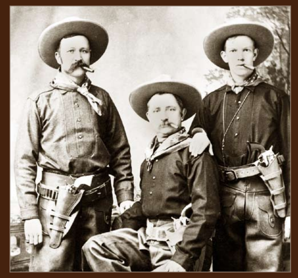
Kansas Cowboys c.1880s

Expecting a city filled with gold, Coronado found only scattered iron pyrites and copper in central Kansas. Looking for Quivira's fabled multi-storied stone houses, he found the Wichita Indians' one-story, straw-roofed round houses. Though he disparaged the Wichita people as "savage," he also praised them as "the best of hunters."