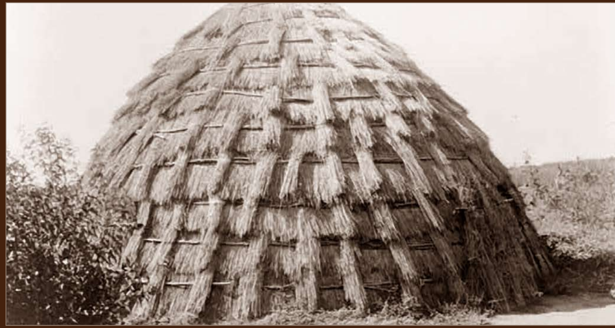
Straw-roofed Round House

"Coronado Sets Out to the North" Frederic Remington